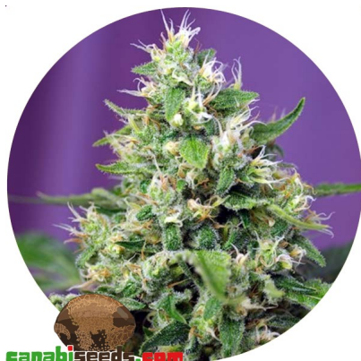
Sweet Amnesia Haze XL Auto